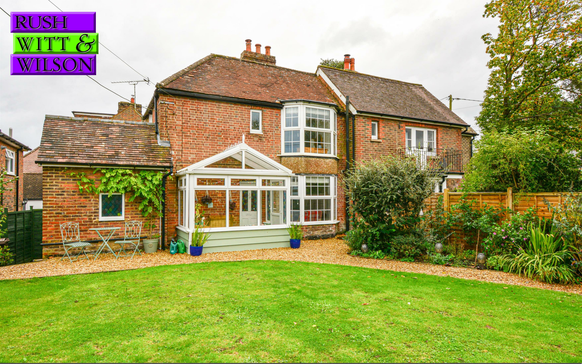
2 Windgrove House, Caldbec Hill, Battle, East Sussex TN33 0JR £315,000